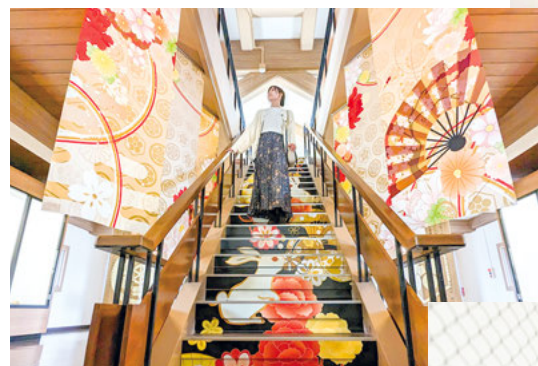
Photo spots inside the castle

Echizen-Ono Castle, categorized as hirayamajo (lit. flatland mountain castle), was built on the 249-meter Mt. Kameyama, located in the Ono Basin. The first lord of the castle was Kanamori Nagachika, who spent four years constructing the citadel and the castle town laid out on a grid pattern. The present-day castle tower was rebuilt in 1968, inside of which the belongings of the successive castle lords are displayed. On a day when the castle town is wrapped up by a sea of clouds and only Mt. Kameyama is seen floating in the air, "Echizen-Ono Castle, the Castle in the Sky" makes its appearance.